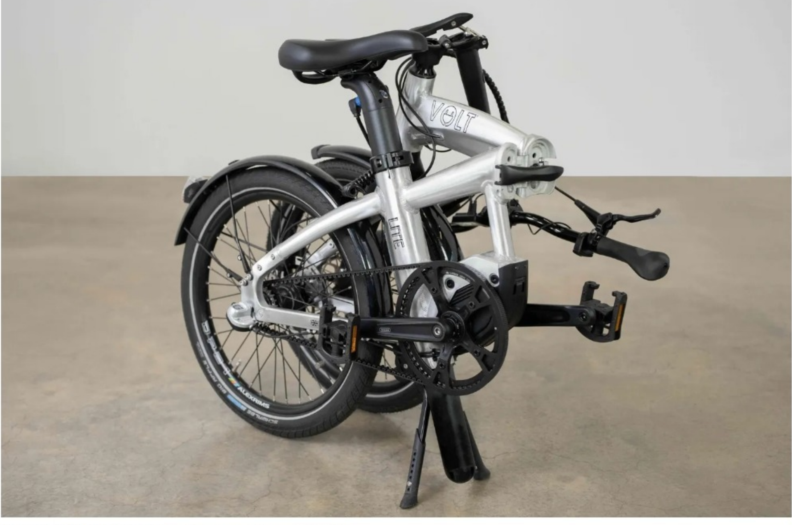
When it's folded the Lite is easy to carry or store VOLT BIKES

Amongst Volt’s folding e-bike range, Lite is the most expensive option at £2,899 ($3,500). Much of this cost is down to its clever battery integration. Volt’s other folding bikes feature batteries attached behind the seat post. While the Lite’s seat post is chunkier than the others, its seamless design makes it an attractive choice. Volt also offers the Metro LS which has a low step frame or the standard Metro model, both of which are priced at £1,949 ($2,400).