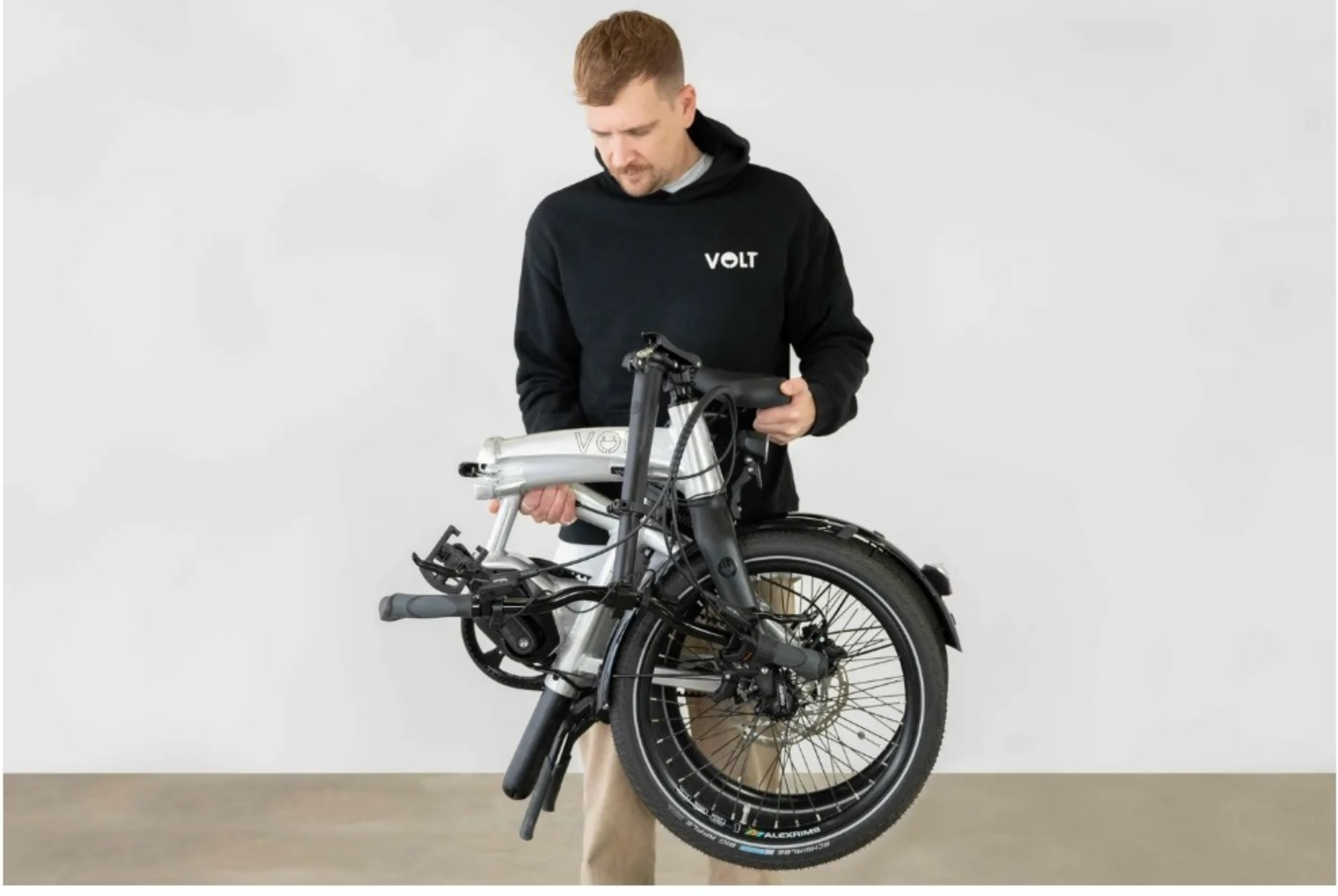
The Volt Lite folds together easily and stays put with cleverly-placed magnets VOLT BIKES

Arguably, the Volt Lite’s most impressive bit of technology is its battery packaging. Disguised in the seat post, its on/off button is positioned just under the seat for easy access. With the bike on, all the important electric information is displayed through its LCD screen. Simple graphics mean it’s easy to quickly look at how fast you’re travelling or remaining charge. Front and rear LED lights come as standard and the bike typically takes around two to three hours to recharge.