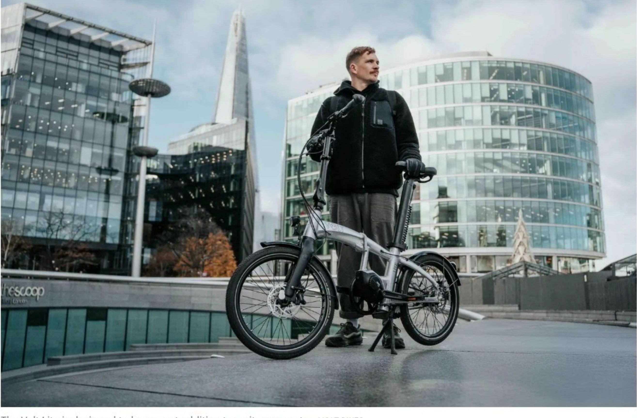
The Volt Lite is designed to be a great addition to a city commute VOLT BIKES

In the Venn diagram of folding bikes and electric bikes, Volt’s Lite folding e-bike was not what I was expecting. For starters, there’s nothing apart from a curly cable winding up to the rear of the seat to indicate any kind of electric wizardry. But before we get into the details on this gorgeous masterpiece of engineering, let’s hear a little bit about Volt.